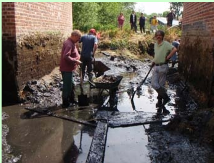
Plank of wood leading up to the 'v' boards. Job done!

The next work party will be at Honing Lock and canal on Sunday 24th June 2012 and remember please do NOT park on the Honing tri-angles as they are required for the people of Honing on that day. Thank you.