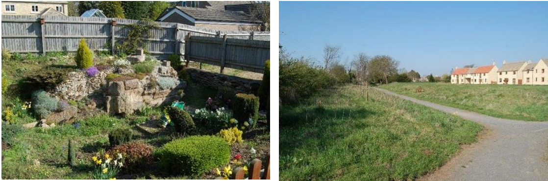
Left: The remains of Tallington Village lock structure, now kept tidy as a nice garden. Right: The outline of the winding hole at Tallington.

The first big surprise for me was a winding hole in Tallington. Once Ken pointed out its position, its shape can clearly be seen in the grass alongside the canal bed. The path runs along the canal bed, and the bench is situated just about in the middle of the winding hole.