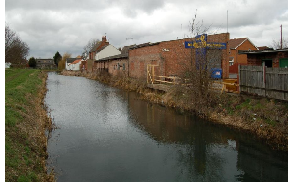
Washing skins on the north bank of the Eau at T.W. Mays, Woolstaplers and Fellmongers, before 1908 whilst a boat appears to be moored just beyond the lean-to. And the same view in 2008.